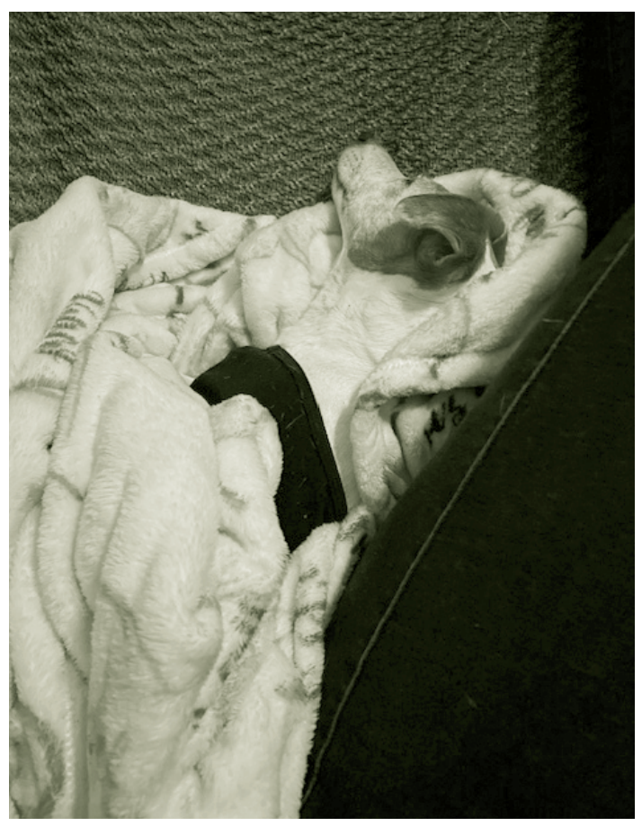
Missy asleep in her new home

As far as a routine, Missy definitely knows when it is time to eat. And she has mastered going outside for her bathroom breaks. Who could ask for anything more!