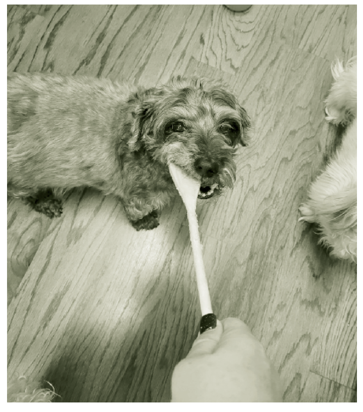
Kitchen tug of war: Johnny's got a good grip on that wooden spoon.