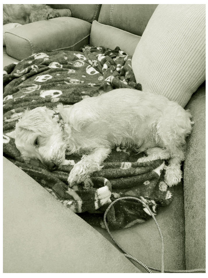
Jackie snoozes on the sofa.

needs something bought for them, my husband and I will prioritize that purchase. Sometimes that might mean waiting on buying a non-essential for ourselves, so we can, in turn, afford to purchase what our pets need each month. Sure, having nine Continued on page 10