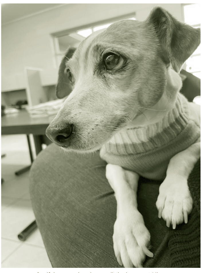
Soulful eyes and a winsome little dog: meet Missy