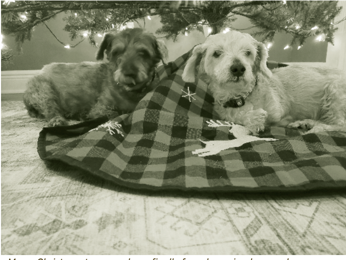
Merry Christmas to us: we have finally found a caring home where we can be happy together.

There are plenty of trips I haven't gone on, places I didn't go after work, or things I didn't buy for myself because our animals, their health, and their needs came first. If one of our animals